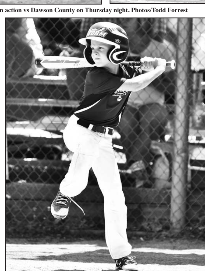
The Union County 10U Baseball team (L-R) fielding, sliding into third, and hitting during its 13-0 win over Clay County, NC on Sunday.